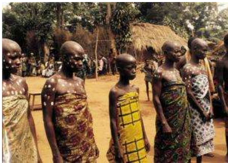
Sexual slavery freedom

Empowering women directly changes social reform