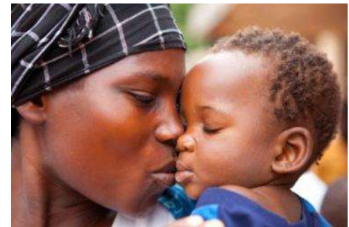
Maternal Health decisions