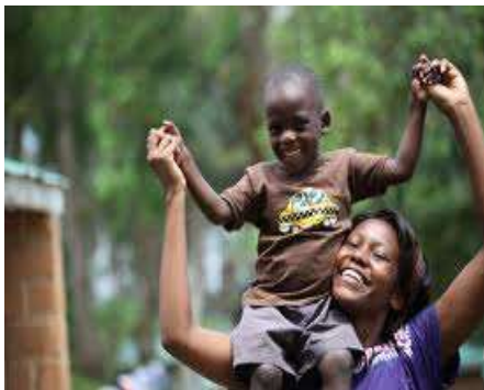
Foster HIV/AIDS orphans