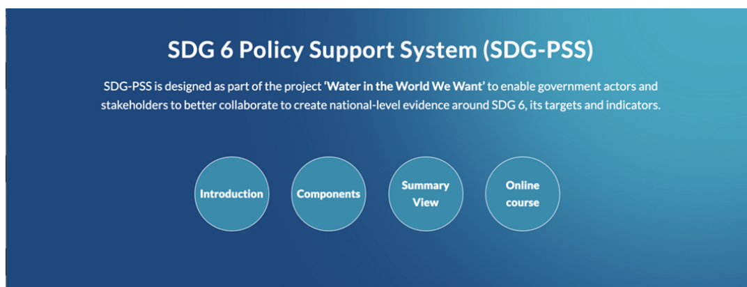
Figure 1. Interface of SDG-PSS showing its main features.

Under increasing urgency to respond to water-related sustainable development, the national governments need to accelerate progress on Sustainable Development Goal (SDG) 6 to assure a sustainable management of water and sanitation for all . Too often, however, governments are faced with competing priorities, limited budgets, and inadequate skilled human capacity. In such cases, systematic evidence provides a strong foundation for countries to build action plans for the achievement of SDG 6. However, deciding on which evidence is needed to support SDG 6 can be difficult, especially when there may be missing or even conflicting evidence.