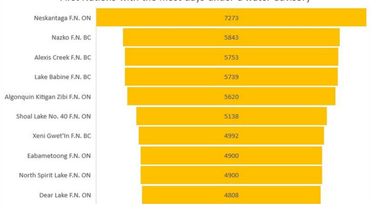
First Nations with the most days under a water advisory

The issues related to water are noted in many indigenous across the country - including the sites under investigation in this project